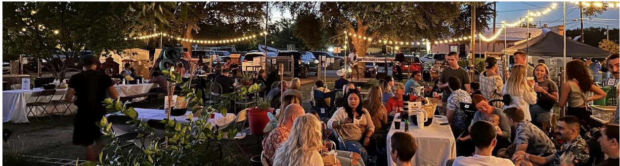
People from all over Del Rio attending one of our Beer Gardens

One of our most impactful fundraisers has been our Beer Garden events with food trucks and live entertainment! The Beer Garden events have been excellent at generating awareness and funds, while bringing the community together for a fun-filled evening.