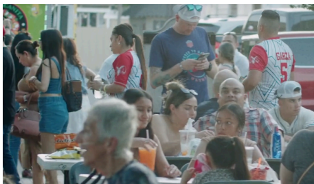
Photo of our Annual Puerto Rican Festival

One of our most impactful fundraisers has been our Beer Garden events with food trucks and live entertainment! The Beer Garden events have been excellent at generating awareness and funds, while bringing the community together for a fun-filled evening.