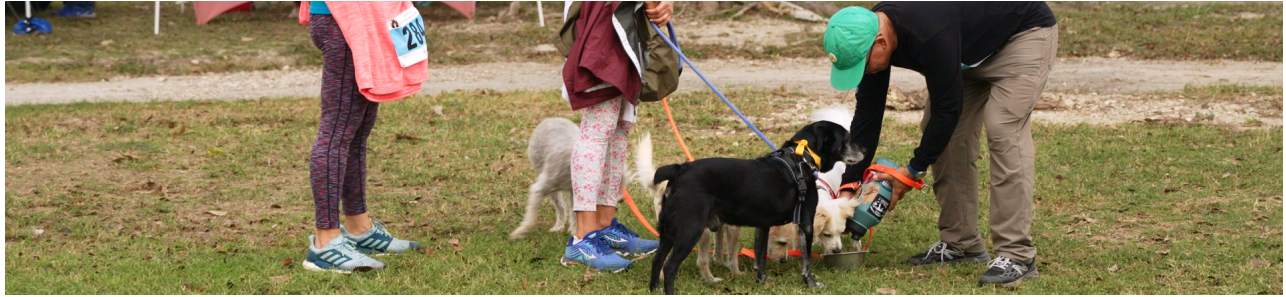
Our annual Bark in the Park 5K event!