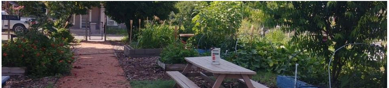
Our beautiful community Garden