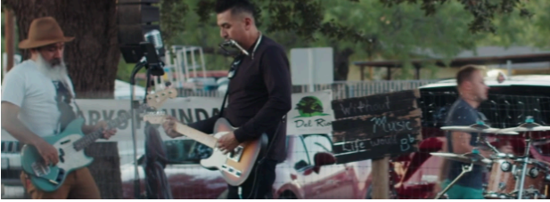
Some photos from one of our Beer Gardens